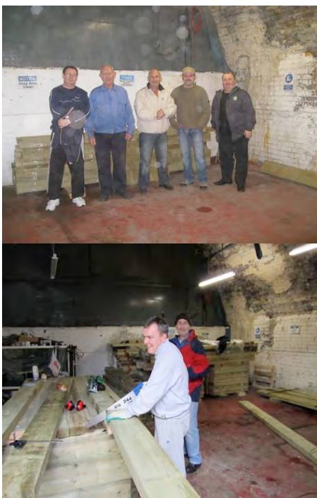
Work Shop activity, construction of raised beds