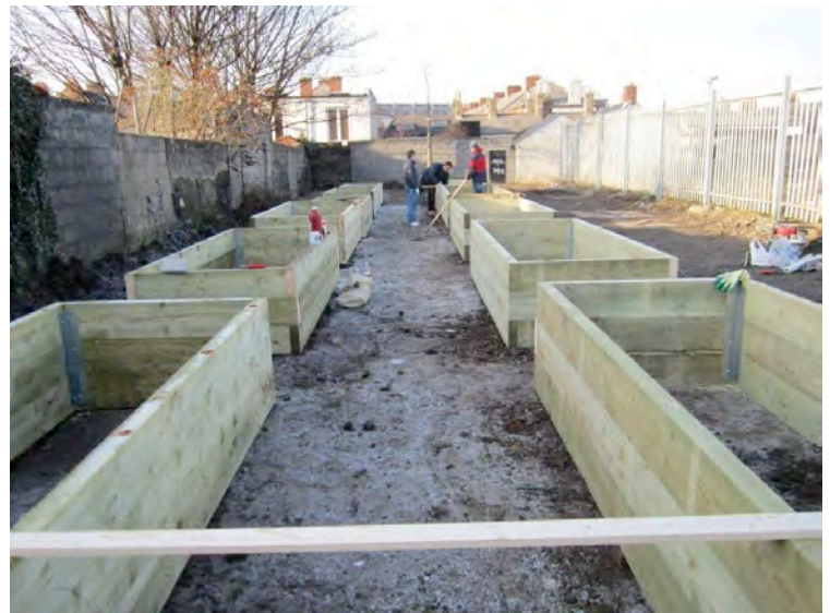
Community Garden as of March 2011