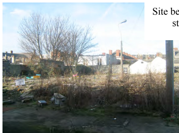
Site before work started

The Pat Murphy Community Garden Programme is a new initiative and forms part of an ongoing strategy by the Larkin Centre, that seeks to widen the engagement of disengaged groups in the North Inner City, in learning activities, specifically targeting men. To date €10,000 has been secured and this has enabled the programme to commence and significant progress to be achieved, however, a further €15,550 is required to realise phase 1 of the programme. The concept, background and the ongoing budget requirements along with some images of the work already completed are set out in the following pages.