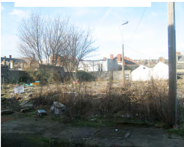
Site as it was in June 2010